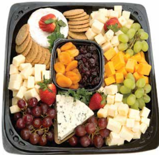
Signature Cheese and Fruit Platter