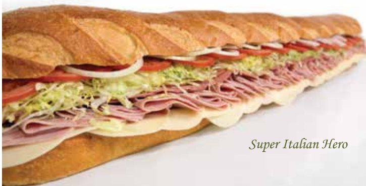
Super Italian Hero

*Boars Head Products are available on any Platters or Sandwiches for an additional cost