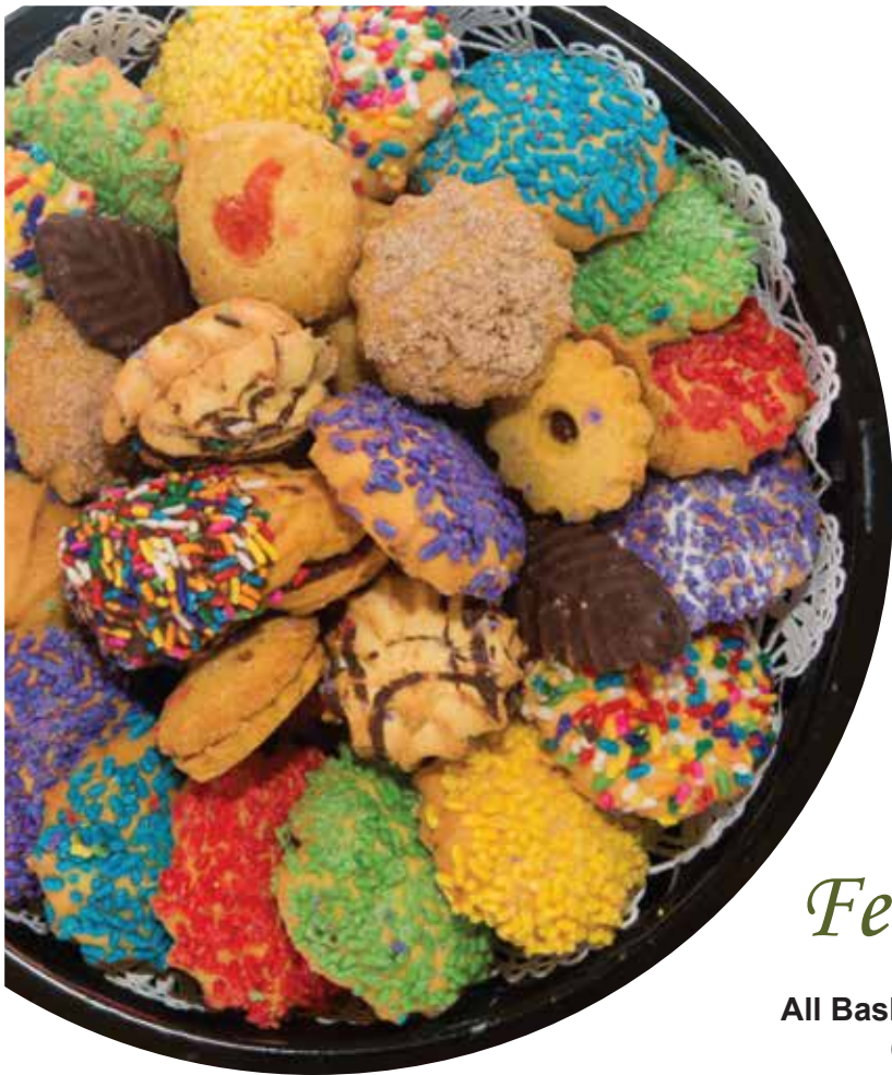
Italian Cookie Platter