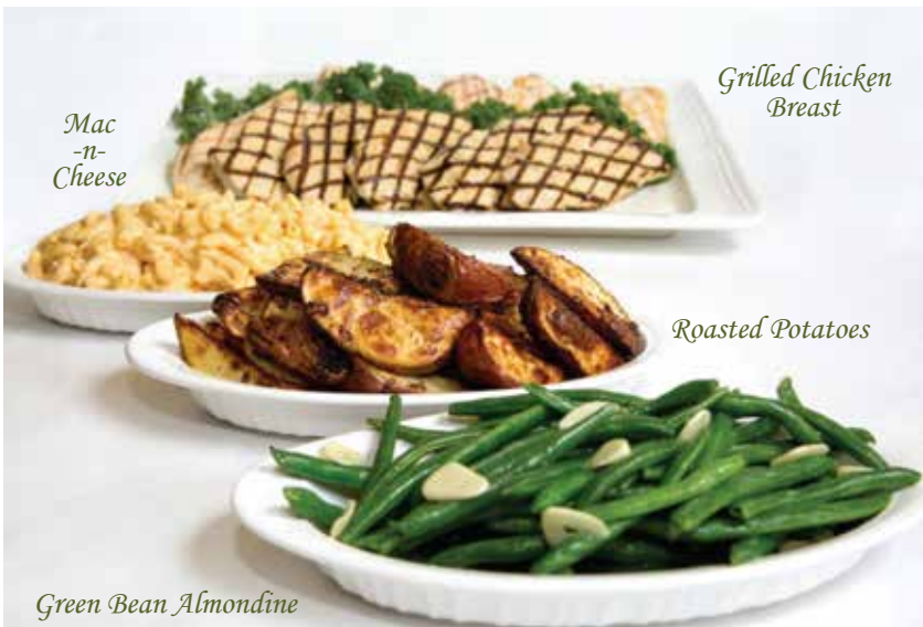
Mac -n- Cheese

Bell Peppers, Yellow Peppers, Yellow and Green Squash, Mushrooms, Red Onions, Eggplant and Asparagus