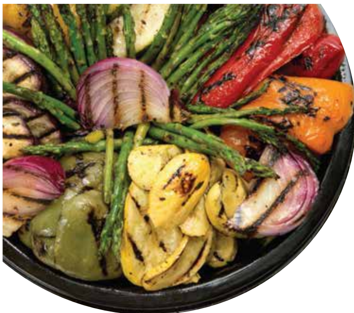
Grilled Vegetable Platter

All Entrées and sides are served in aluminum 1/2 pan trays. Serves 8 to 10